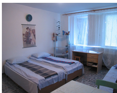
University hostel room